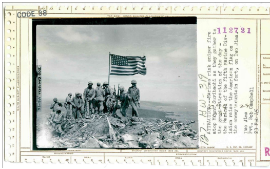
Flag Raising on Mount Suribachi, Iwo Jima, Japan, 2/23/1945.