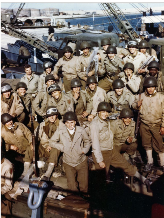
Photograph of American Troops on LCT Preparing for Normandy Invasion, 6/1944. National Archives Identifier 12008276