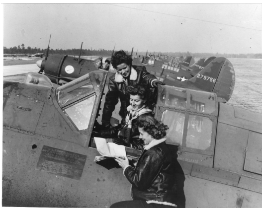
WASPs Around a Curtiss A-25A, ca. 1943.