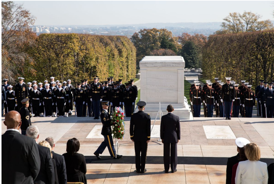
President Barack Obama Participates in a Wreath Laying Ceremony at the Tomb of the Unknown Soldier, 11/11/2012. National Archives Identifier 176552676

This new exhibit on Google Arts and Culture showcases special media records, including drawings, photographs, and film, relating to the history of the Tomb of the Unknown Soldier. The Tomb is one of America's most iconic memorials and is visited every year by millions of visitors.