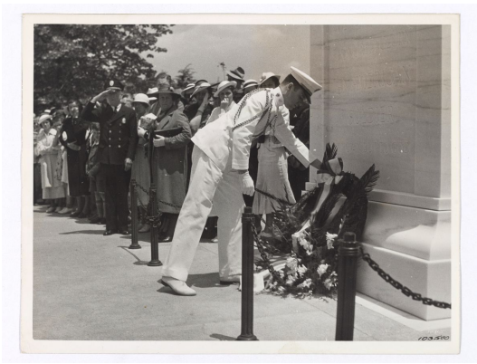
Memorial Day Services, Memorial Amphitheatre, Arlington National Cemetery, 5/30/1936. National Archives Identifier 209280045