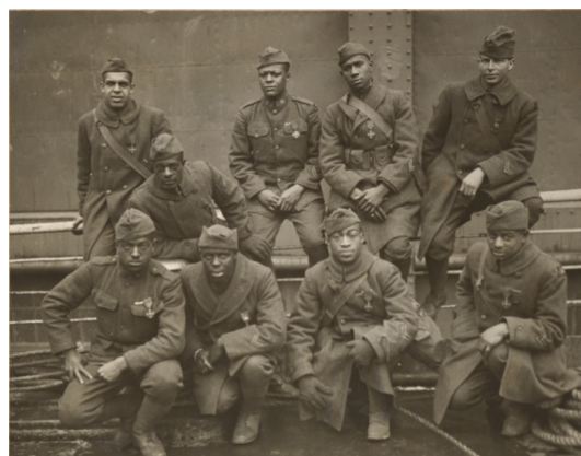
Men of 369th (15th N.Y.) who won the Croix de Guerre for gallantry in action, 2/12/1919. National Archives Identifier 26431282