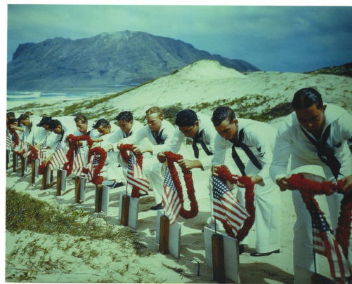
Photograph of Sailors Paying Tribute to Casualties of the Pearl Harbor Attack at a Hawaiian Islands Cemetery. National Archives Identifier 12009116