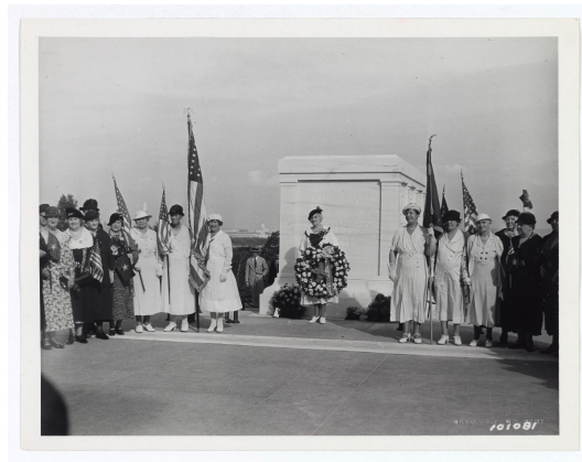
Annual Pilgrimage of the Gold Star Mothers, Inc. of New York and nearby States, to the Tomb of the Unknown Soldier, Arlington National Cemetery., 9/30/1934. National Archives Identifier 209280039