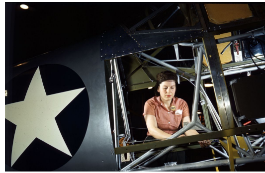
Woman Working on Inside of SNV Fuselage at Consolidated Vultee Aircraft Plant in Downey, California, 7/1943.