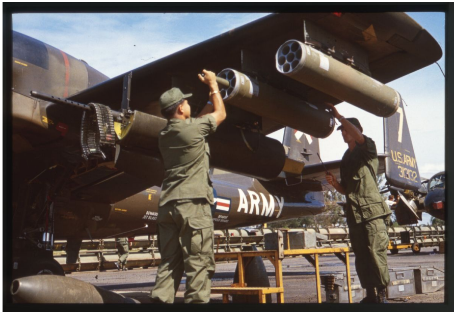
Color Photographs of Signal Corps Activity, 1944 - 1981. 2.75 mm Rockets Loaded on to a OV-1A, 9/11/1967. National Archives Identifier 176250302

The National Archives is proud to serve veterans and their families, especially through our work at the National Personnel Records Center in St. Louis, MO . You can find out how we help veterans access their records to receive benefits , and read about the work our Preservation staff do to make these records accessible. Be sure to take a look at our free special programs on topics from the Revolutionary War to the Tomb of the Unknown Soldier and World War II movies.