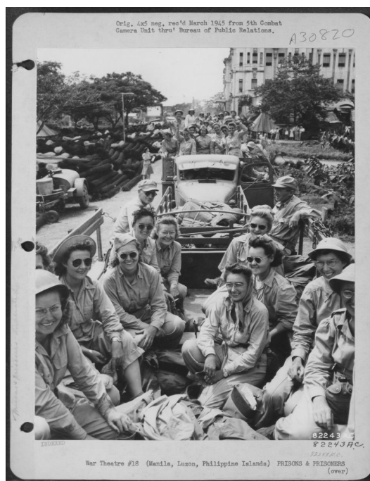
U.S. Army nurses arrive to relieve the nursing problem of Santo Tomas University prison camp, Manila, Luzon, P.I.