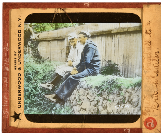
L: Lantern Slide of Explaining Baseball to a British Sailor.