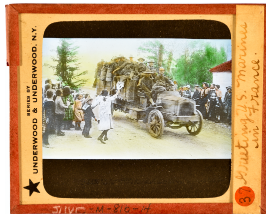
R: Lantern Slide of Greeting U.S. Marines in France. National Archives Identifier 178140520

In addition, this series includes views of various naval vessels from World War I. Some of the images are artist renderings of ships from that era. Among the types of ships pictured are destroyers, battleships, and submarines.