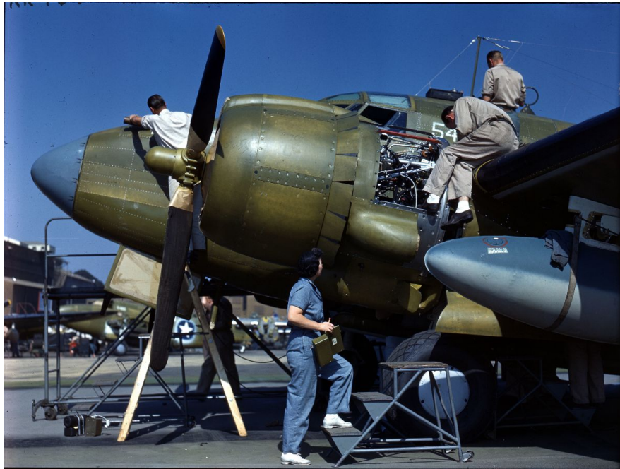
PV-1 is Given Final Checkup at Vega Aircraft Corporation Plant in Burbank, California.

The U.S. Government, long committed to black and white film and equipment for 4"x5" and larger formats, only slowly began to appreciate the usefulness of color emulsions. As the military and civilian war efforts in the United States and overseas expanded, greater use was made of color materials in presenting these activities in a lifelike way. The color photographs in this series are the U.S. Navy's official color photography file chronicling the Navy's burgeoning roles and responsibilities during the war, illustrating all aspects of the navy's activities.