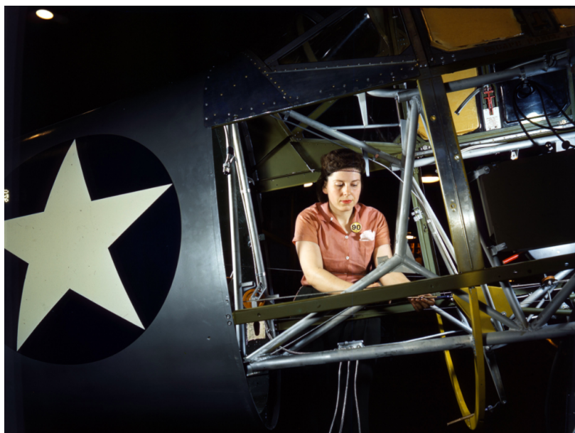
Woman Working on Inside of SNV Fuselage at Consolidated Vultee Aircraft Plant in Downey, California, 7/1943.

The U.S. Government, long committed to black and white film and equipment for 4"x5" and larger formats, only slowly began to appreciate the usefulness of color emulsions. As the military and civilian war efforts in the United States and overseas expanded, greater use was made of color materials in presenting these activities in a lifelike way. The color photographs in this series are the U.S. Navy's official color photography file chronicling the Navy's burgeoning roles and responsibilities during the war, illustrating all aspects of the navy's activities.